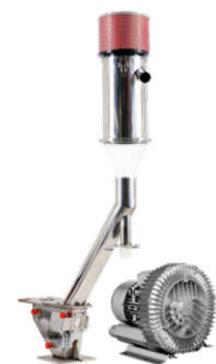
旋风回收系统 Cyclone recovery system