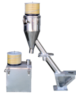
离尘回收系统 Dust recovery system