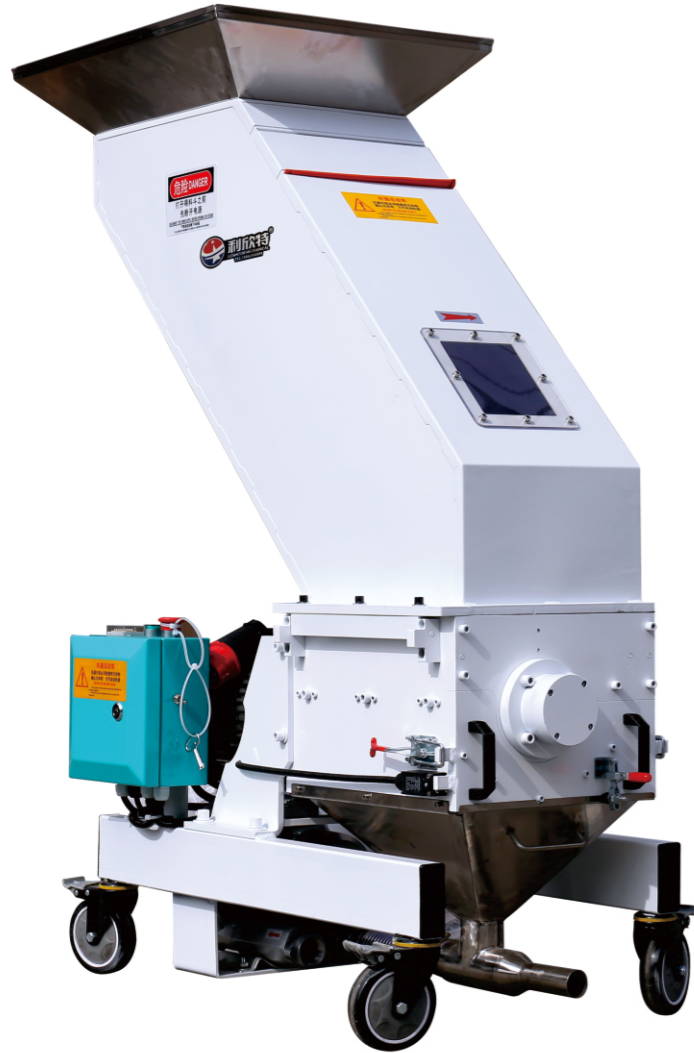
粉碎效果 Crushing effect